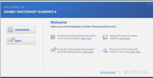
Screen that is shown when you initially open Photoshop